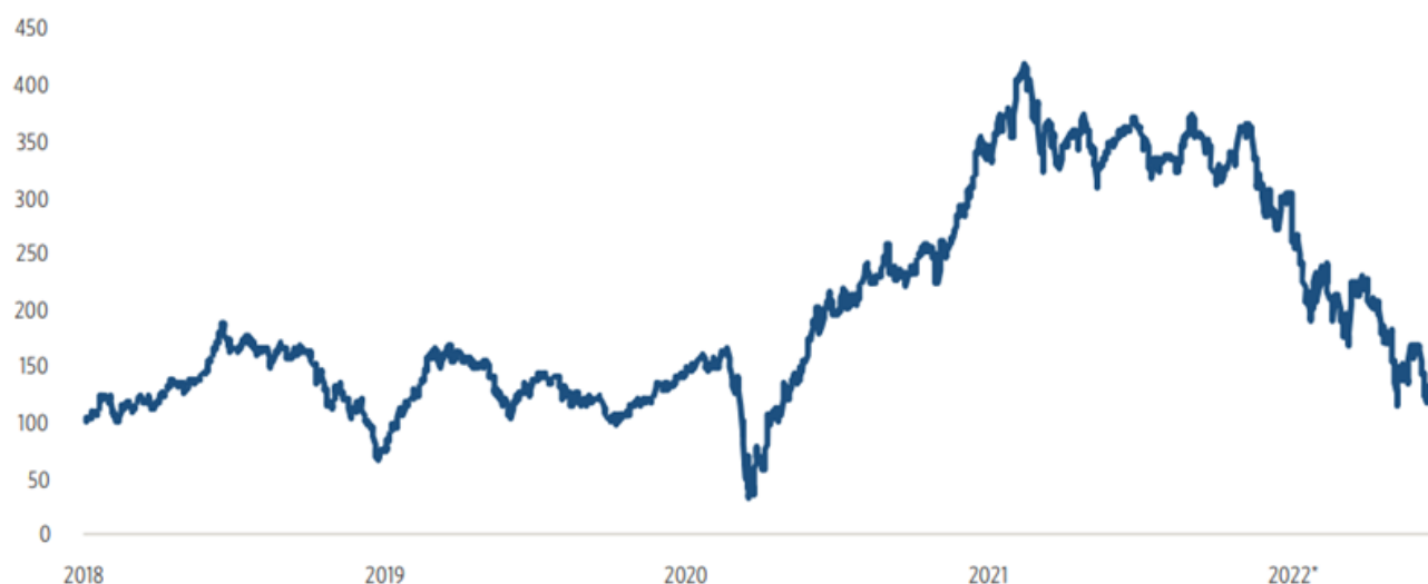
PE-backed IPO index

Geography: Global *As of June 30, 2022