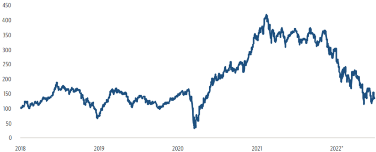
PE-backed IPO index

Geography: Global *As of June 30, 2022